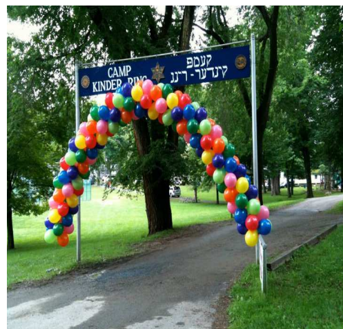
Our home away from home