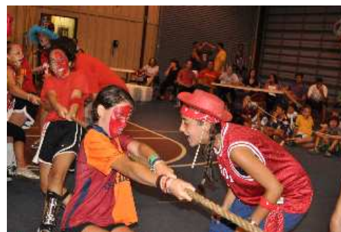
OLYMPIC TUG 2010